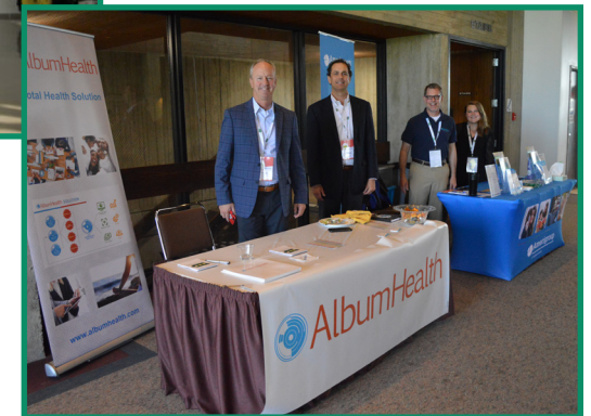
Exhibitors at the 2019 HSI Annual Conference in Ames

EXHIBITOR BENEFITS INCLUDED IN ALL ANNUAL CONFERENCE SPONSOR PACKAGES!