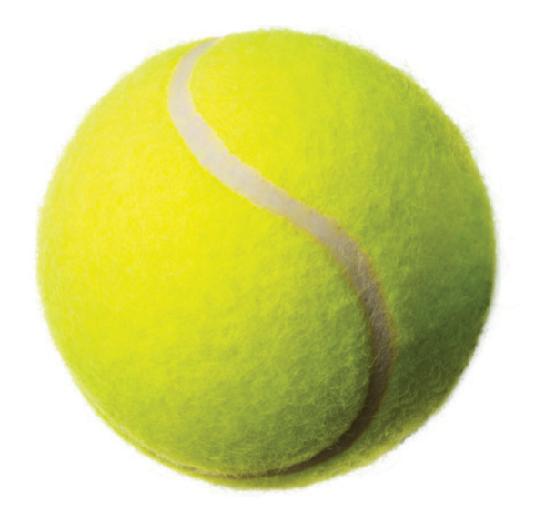
A serving of fruit or vegetables is about the size of a tennis ball.

A serving of meat, fish, or poultry is equal to a deck of cards.